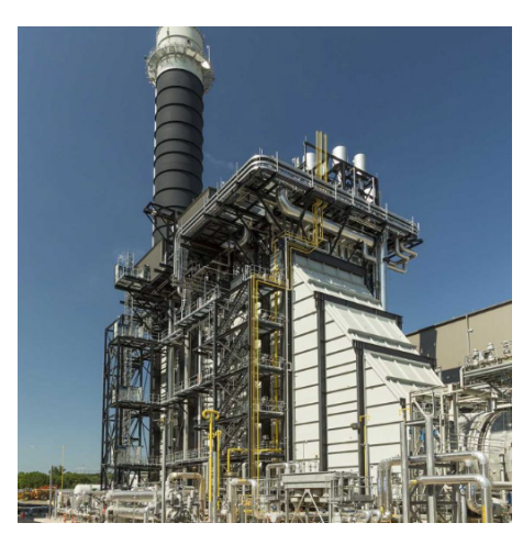
Heat Recovery Steam Generator